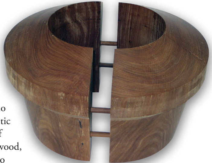
Lignum Vitae thrust bearing.

In most wet applications, there is no substitute for longtime industry-standard lignum vitae wood. Promising service life of up to 60 years or more, “lig” has no serious competition, even from the most modern synthetic materials. Woodex is thoroughly familiar with the art of working this material, and furnishes only select quality wood, precisely machined and carefully sealed in paraffin wax to minimize dimensional changes due to atmospheric conditions.